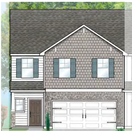
THE CAMDEN RIGHT SIDE GARAGE