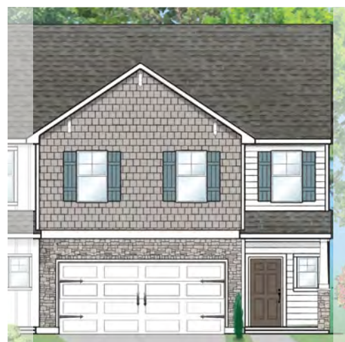
THE CAMDEN LEFT SIDE GARAGE